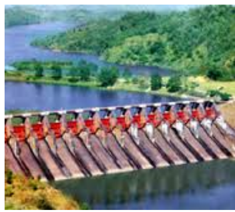
Figure 13.3: Karnafuli Hydro Power Station