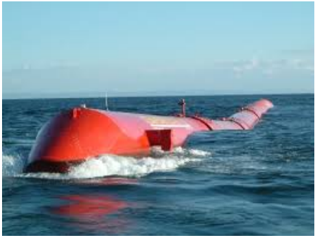
Figure 9.3: An example of a surface wave power generation method